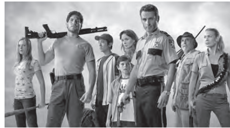
The Walking Dead is now fast tracked 33 hours after airing the US, however many will still opt to illegally download new episodes

Homeland attracted over 1.2 million Aussie viewers when it premiered on Ten in January, and has since drawn international critical acclaim. Earlier this month, the season two Australian premiere of Homeland attracted just half of that audience, despite airing only