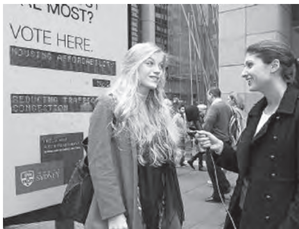
"No, I don't care about these giant advertisements."

In recent years the university has tried to make the student union its personal plaything and has assigned a disappointing amount of SAFF funding to the Students' Representative Council. It has reacted first apathetically then adversely to the efforts by students to mobilise against official policy; for