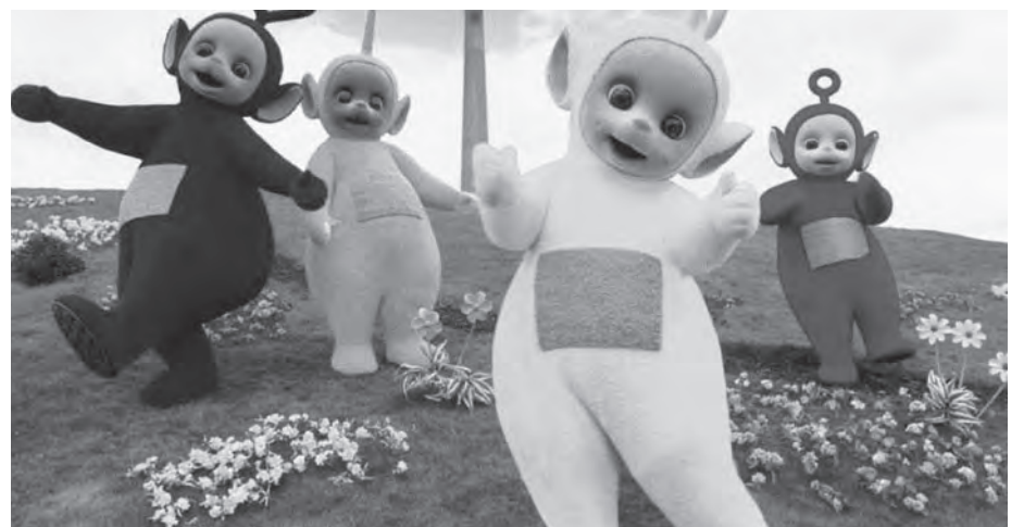
Pictured below: Teletubbies baying for your blood

So, kids, with the above in mind, always remember: the key to perfecting a science is experimentation. And extensive research. Otherwise, keep pumping caffeine, sugar and alcohol into your body on a daily basis: they are society's acceptable addictions, but might not be the only ones for much longer.