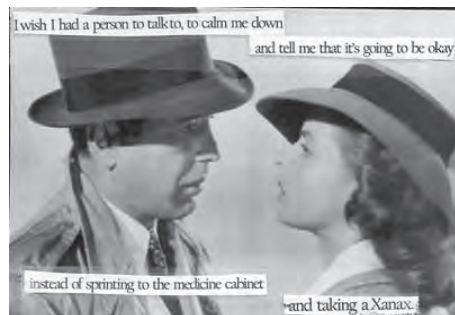
PostSecret: where Xanax users unite

Sleepwalking, hallucinations and delusions are some of the known side-effects of zolpidem (Ambien, Stilnox) which is a prescription sleeping pill. For a drug experience devoid of sleepwalking theatrics, there's alprazolam (Xanax), one of the most abused benzodiazepines in the country. The past decade has seen a steady rise of Xanax prescriptions in Australia, so there's a good chance that someone you know is currently stocked up.