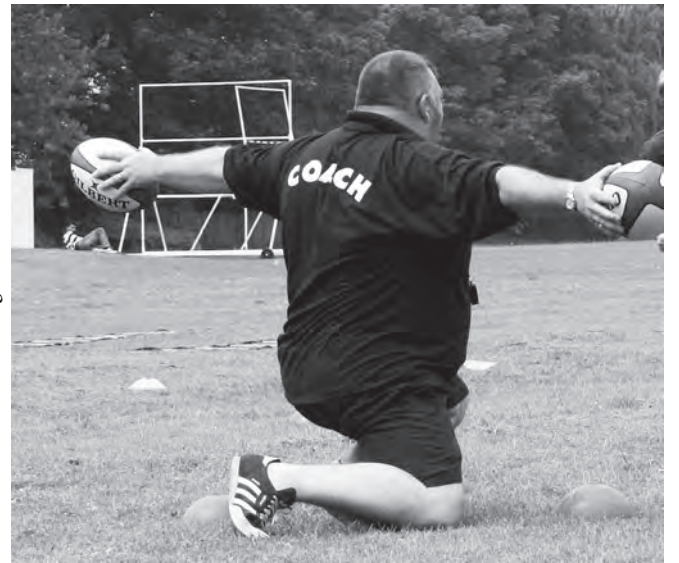
Not a word...

I lived for college. I only went to university so that I could go to college.